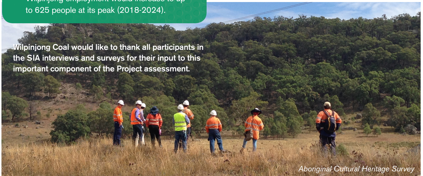
Aboriginal Cultural Heritage Survey

Flora and fauna surveys are currently being conducted on some potential biodiversity offset areas on Peabody-owned land.