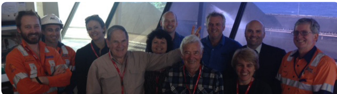
CCC members, Peabody and Port Kembla staff take a tour of the coal terminal