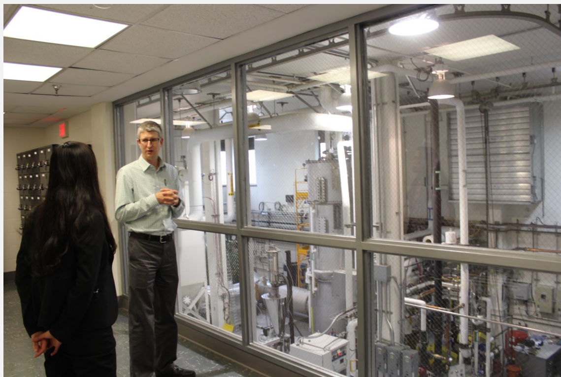
A view overlooking the Advanced Coal & Energy Research Facility at Washington University in St. Louis, where the Consortium for Clean Coal Utilization engages the world's best minds in clean coal research and aims to improve public understanding of coal as a source of energy. Peabody is a founding member of the consortium and has committed $6.5 million since its inception.

"We need more emphasis on policy development and implementation for use of coal in a cleaner manner, particularly in developing countries. These nations need to eliminate household use of coal for heating and cooking, and instead promote its use in larger centralized plants. The resulting lower electricity costs will drive increased economic development in those regions," stated Dr. Axelbaum.